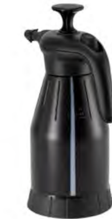
view stripe with graduated scale