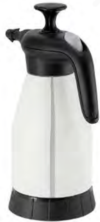
view stripe with graduated scale